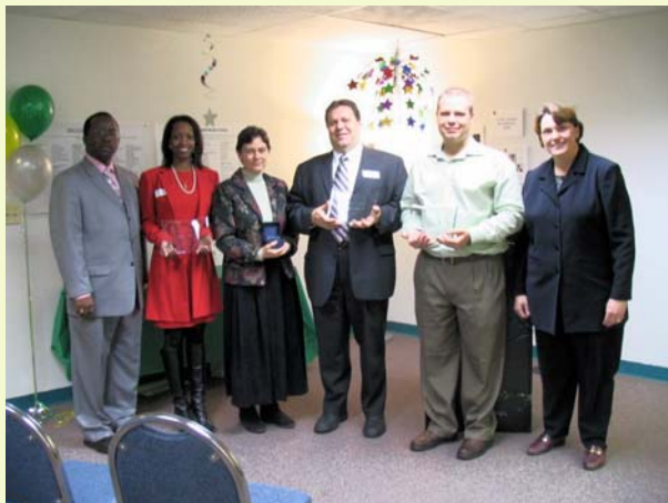
Award Winners at our Annual Board Meeting, with our Board President and Executive Director