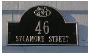
Swillburg residents received free house plaques last summer as part of Healthy Blocks.

Spring is coming! (Really...) NeighborWorks® Rochester is gearing up for Healthy Blocks again. We will be working with residents of Swillburg again to develop and maintain visible neighborhood change. In 2006 there will be many more opportunities for residents to be involved in Healthy Blocks.